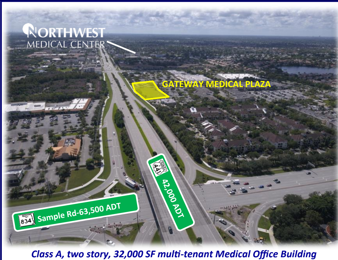
Class A, two story, 32,000 SF multi-tenant Medical Office Building